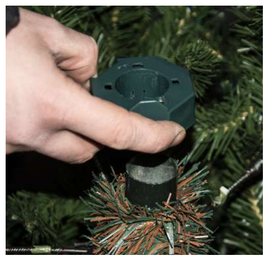
3. Remove connection plate from the bottom section by simply pulling upwards.