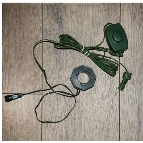
4. The foot pedal will now be completely detached from the tree and be able to be removed and put to one side.