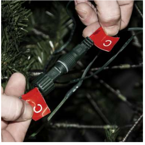
2. Locate connections C-C in the foliage of bottom section of the tree and disconnect.