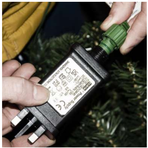
1.Remove cable from transformer