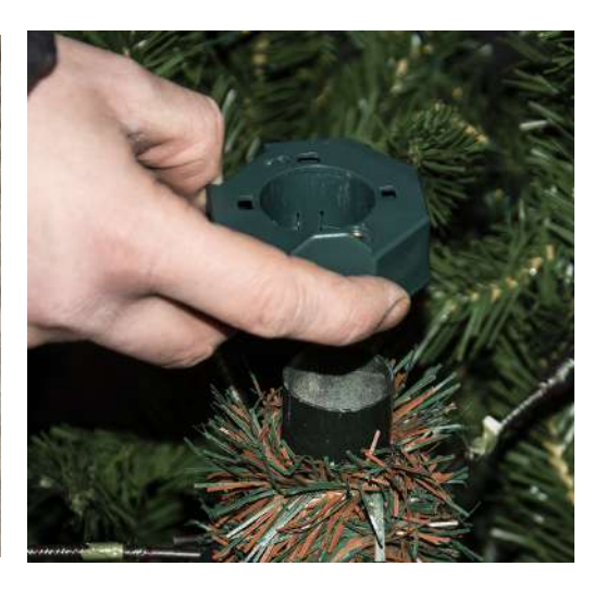
5. Take the new connection plate and push on the pole at the top of the bottom section replacing the one removed. Feed the wires and the foot pedal through foliage.