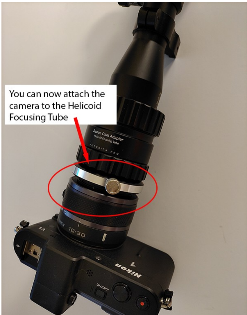
You can now attach the camera to the Helicoid Focusing Tube

Now attach the Lens Filter Ring to the Camera / Plate Ring Mount. And turn the Tightening knob Clockwise to secure the Lens Filter Ring.