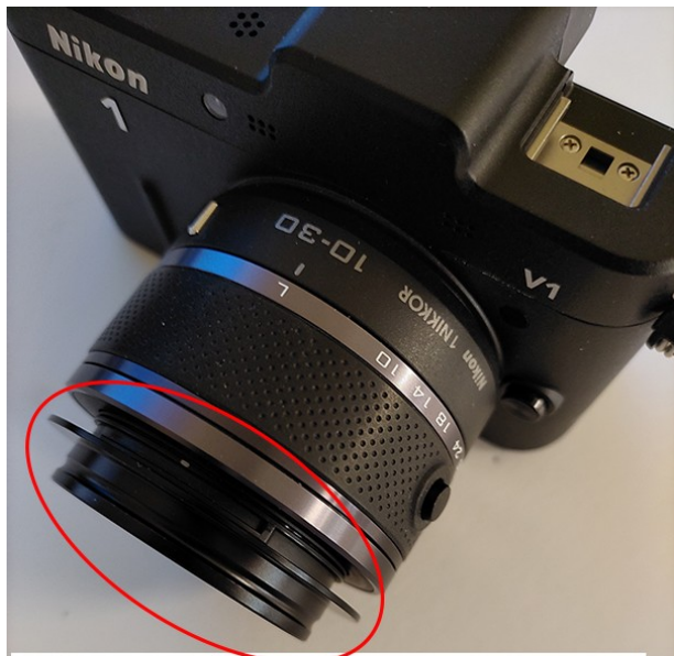
Now attach the 40.5 Lens Filter Ring, and attach ring to the camera Lens 40.5 filter threads.

Attach the Filter Ring to the Camera lens / Lens filter ring turns on Clockwise Off is Counter Clockwise.