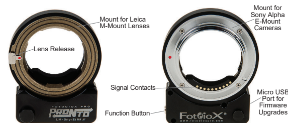
PRONTO Adapter - Rear