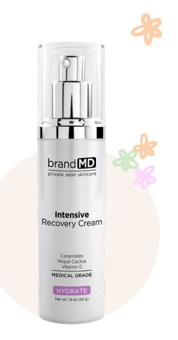
Intensive Recovery Cream