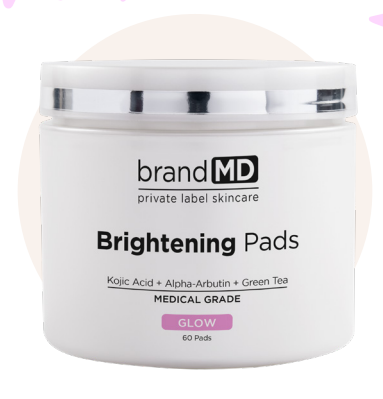
Brightening Pads brightens dull skin