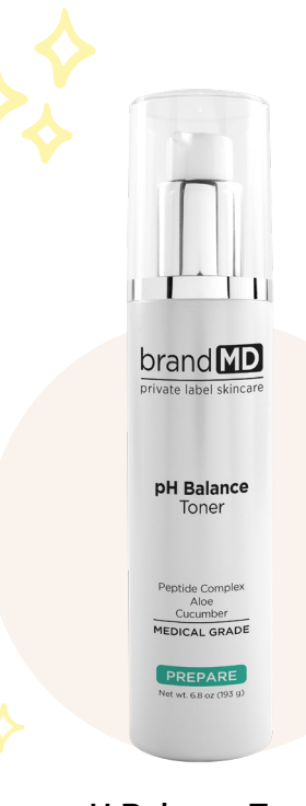
pH Balance Toner cleanses, clears, and preps