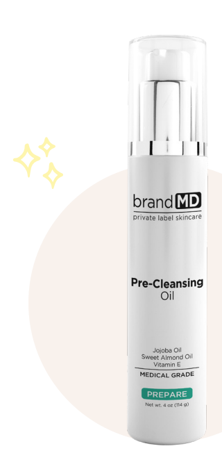
Pre-Cleansing Oil prepares the skin for a proper cleanse