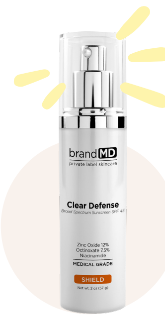
Clear Defense protects and reduces redness + blotchiness