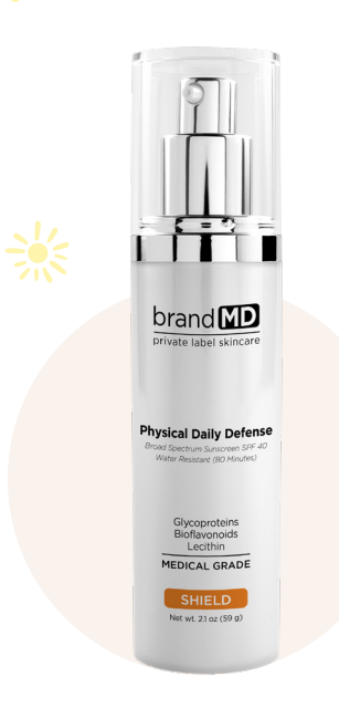
Physical Daily Defense mineral sunscreen for all skin types