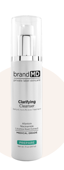
Clarifying Cleanser salicylic acid powered deep cleanse