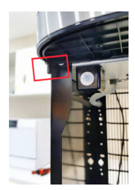
Step 6 Locate the pin hinge.

Using the screwdriver, remove the screw and place it in a safe location, like a magnetic tray.