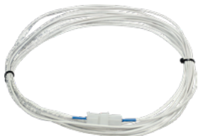
25-FOOT EXTENSION CABLE

CONTENTS: Low level Pump Protection Unit; Float Switch; 8-foot Extension Cable for Float Switch