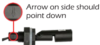
Float Switch in "Dry" Position