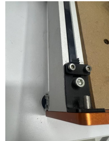
Step6: fix the belt and bracket on the other end.