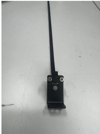
Step1: assemble the belt to the bracket

https://drive.google.com/file/d/1q3tT-f61nEkFC7vImbhxVlvWBdN-CR2t/view?usp=sharing