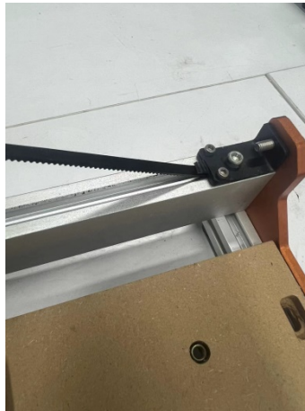
Step2: install the belt and bracket to the profile.