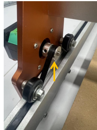
Step5: put it on the synchronous wheel