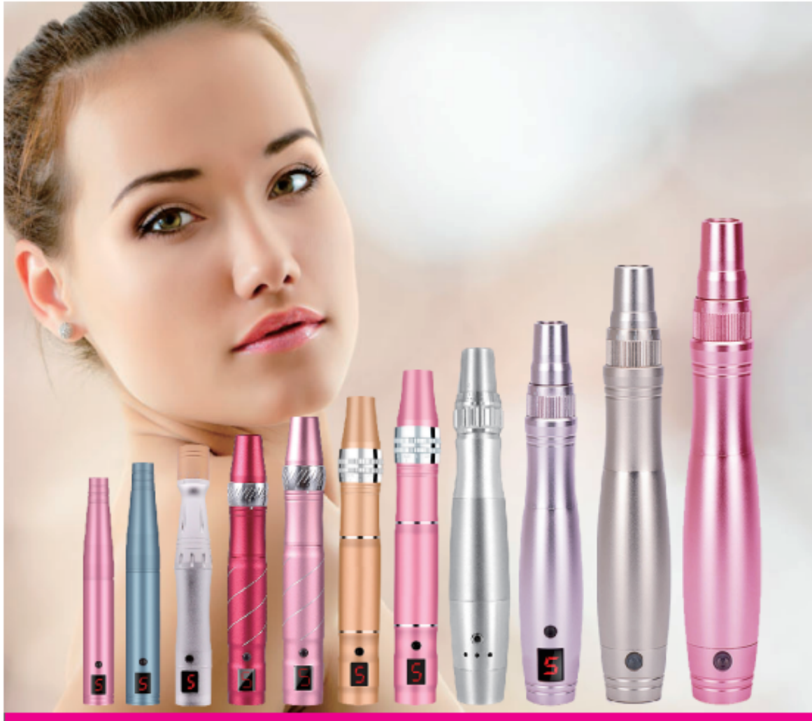
ELECTRIC NANOCRYSTALS BEAUTY INSTRUMENT