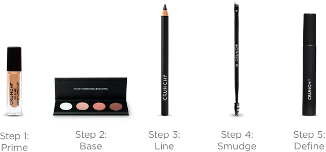
Step 1: Prime