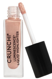
Step 4: Highlight