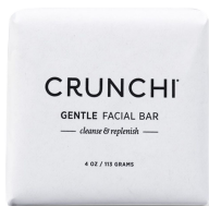
Step 1: Cleanse