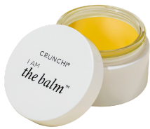
Step 1: Cleanse