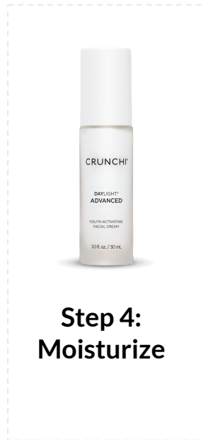
Step 4: Moisturize