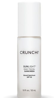
Step 5: Protect