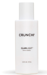
Step 2: Tone