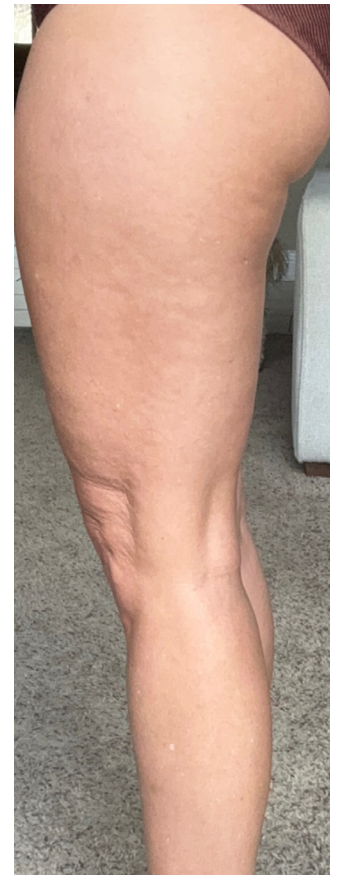
After 4 days (used 2x daily)