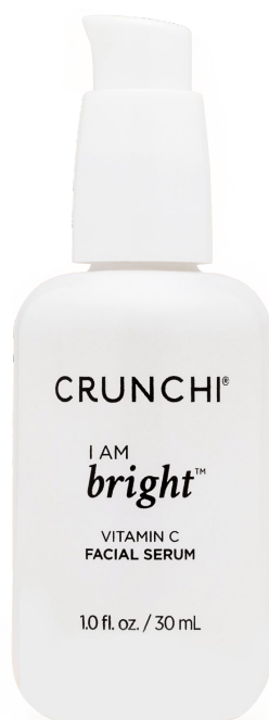
————— Glass Bottle