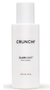
Step 2: Tone