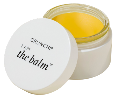
Step 1: Cleanse