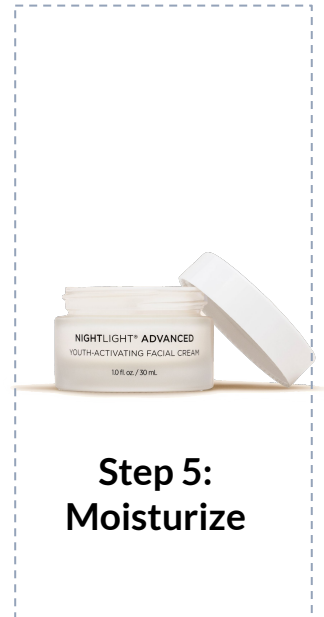
Step 5: Moisturize