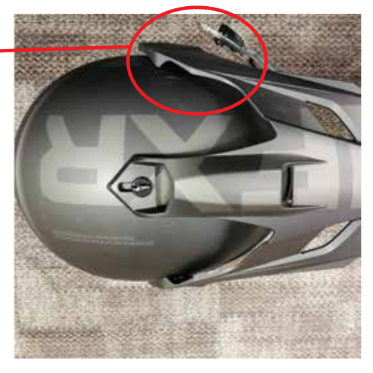
3. Lift visor and shield from the pivot as shown. Do the same procedure on both sides.