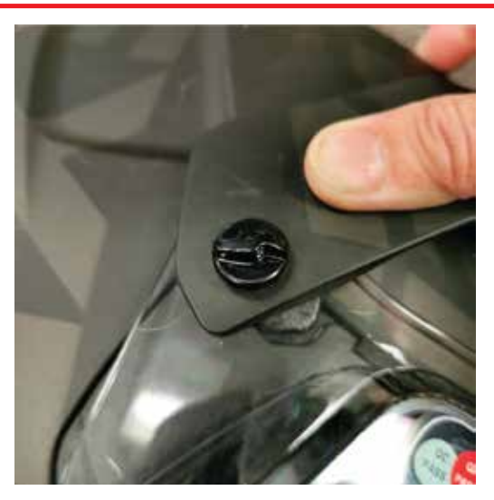
1. Align shield and visor with the pivot hole as shown, then install the screw. Do the same procedure on both sides.