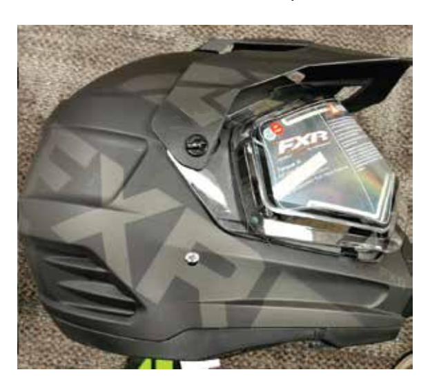
2. Adjust the visor to the desired angle and tighten all three screws (clockwise).